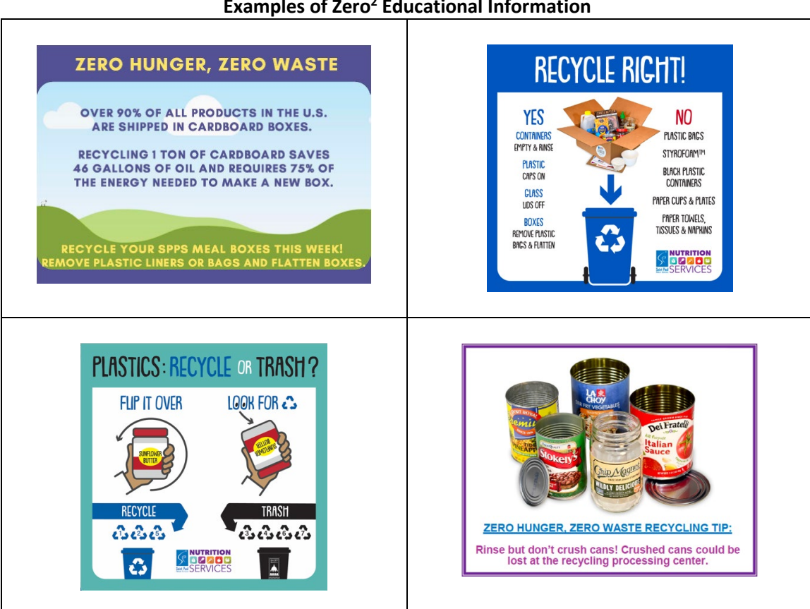
Figure 2. Examples of Zero<sup>2</sup> Educational Information

Examples of Zero<sup>2</sup> educational information are provided in Figure 2. By July 2021, Zero<sup>2</sup> educational information was published in 490,582 booklets.